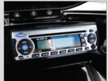
Stereo system with MP3 port