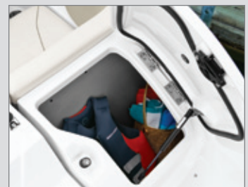
Dual rear storage