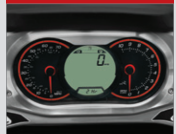
Gauge with Cruise control and ECO mode