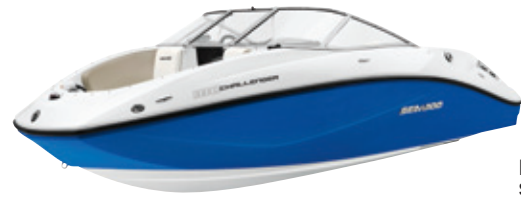
Riviera Blue SE model shown