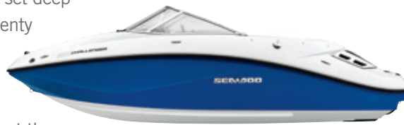
Riviera Blue SE model shown

While the measurements say it's a 17' 7" boat, one ride might tell you otherwise. Its engine is set deep in the hull to open up space onboard so plenty creature comforts could be packed into its compact frame. And newly added iTC™ technologies like Docking mode, ECO™ mode, and Cruise control complement the supercharged engine designed for performance.