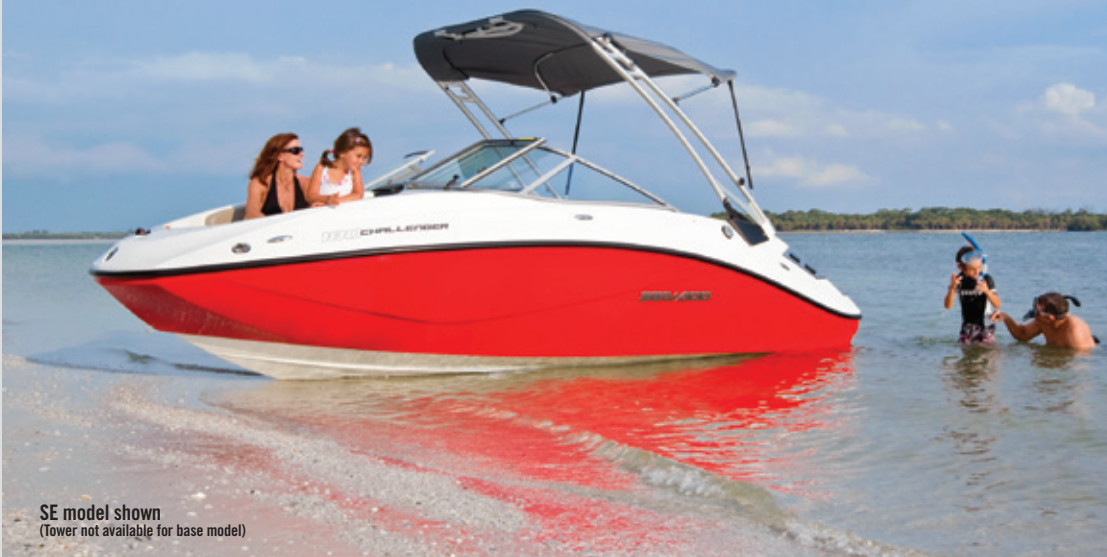
SE model shown (Tower not available for base model)

While the measurements say it's a 17' 7" boat, one ride might tell you otherwise. Its engine is set deep in the hull to open up space onboard so plenty creature comforts could be packed into its compact frame. And newly added iTC™ technologies like Docking mode, ECO™ mode, and Cruise control complement the supercharged engine designed for performance.